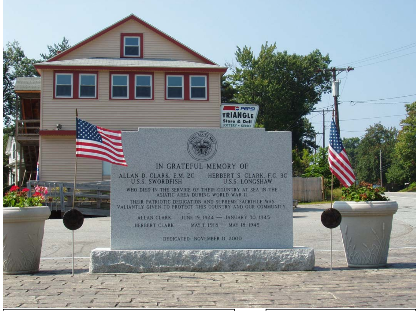
'Clark WWII Monument' Main Street & Groton Road