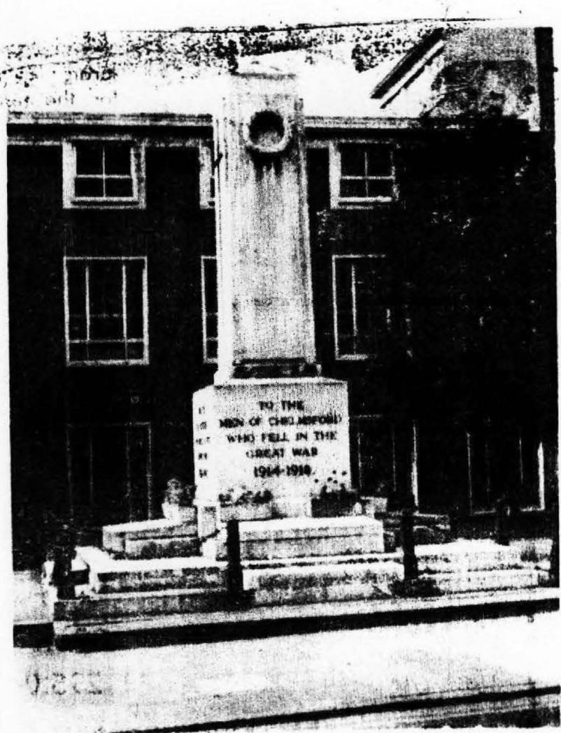
WORLD WAR I MEMORIAL in front of the Civic Center (Town Hall), Chelmsford, England

The hammer was retired from duty at that time and only recently was found and turned over to the Historical Society for safe keeping in its museum.