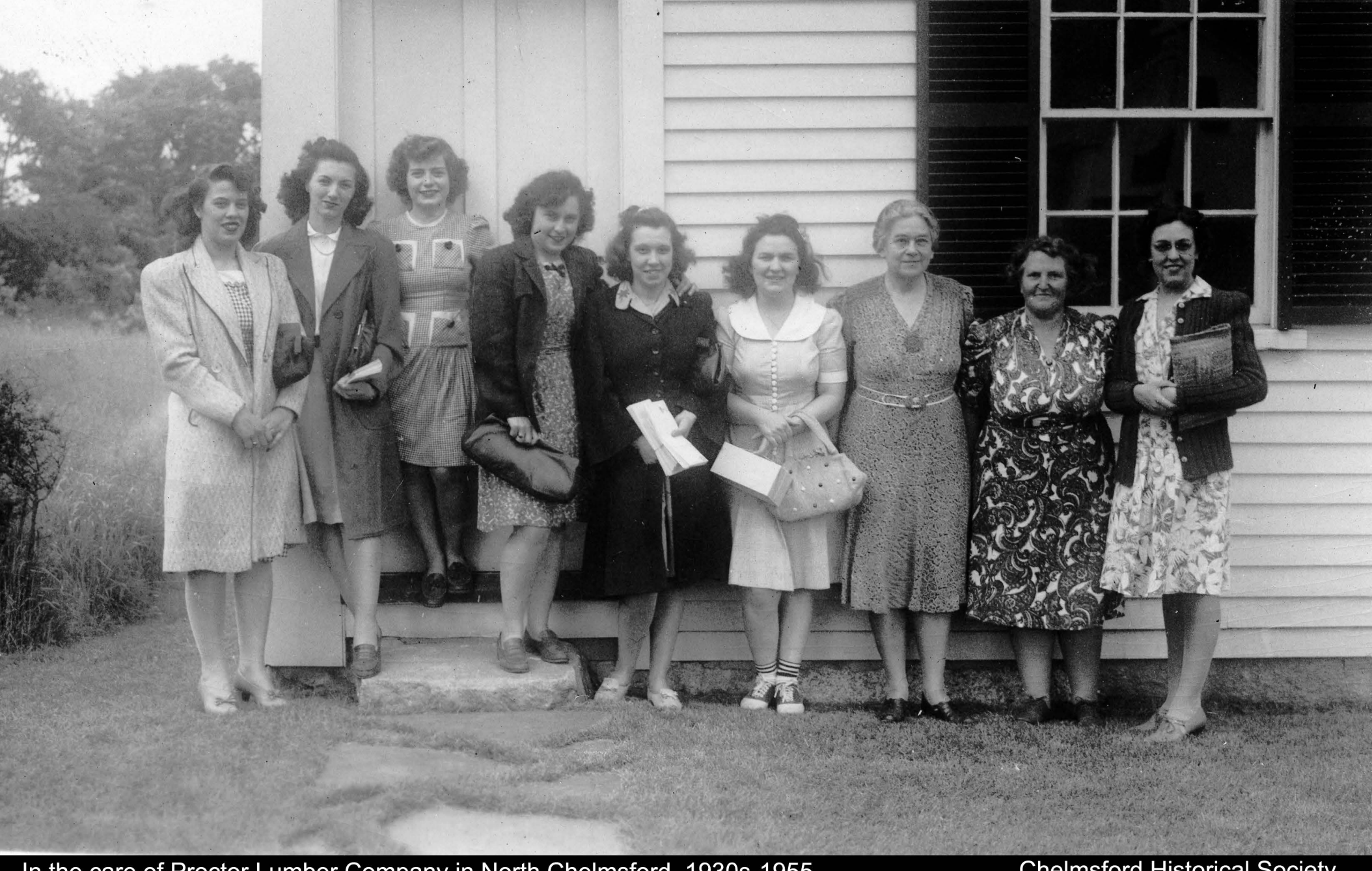
In the care of Proctor Lumber Company in North Chelmsford, 1930s-1955