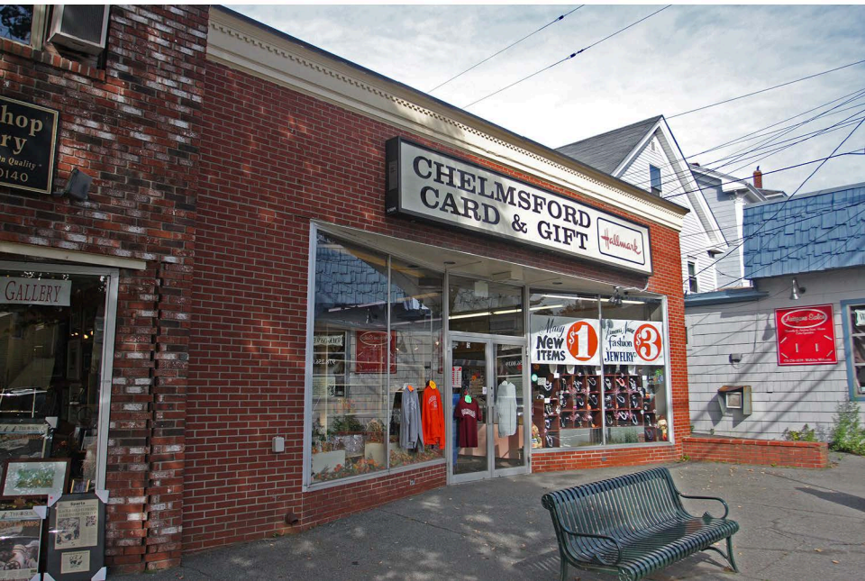
Chelmsford Card and Gift, October 12, 2011, photo by Fred Merriam