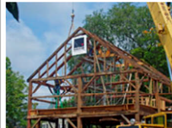
Fiske House Barn Dismantling 2004

Welcome! The Chelmsford Historical Commission was established under Massachusetts General Law Chapter 40 Section 8D and is comprised of three to seven members. All are volunteers who are appointed by the Town Manager, and approved by the Board of Selectmen for a 3-year term.