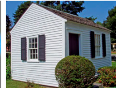
Middlesex Canal Tollhouse