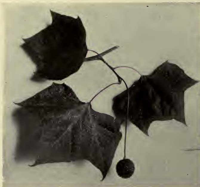
LEAVES AND SEED-BALL OF THE ORIENTAL PLANE

Probably no tree more nearly meets these conditions than the Oriental Plane, which has been gaining rapidly in favor with the American public during