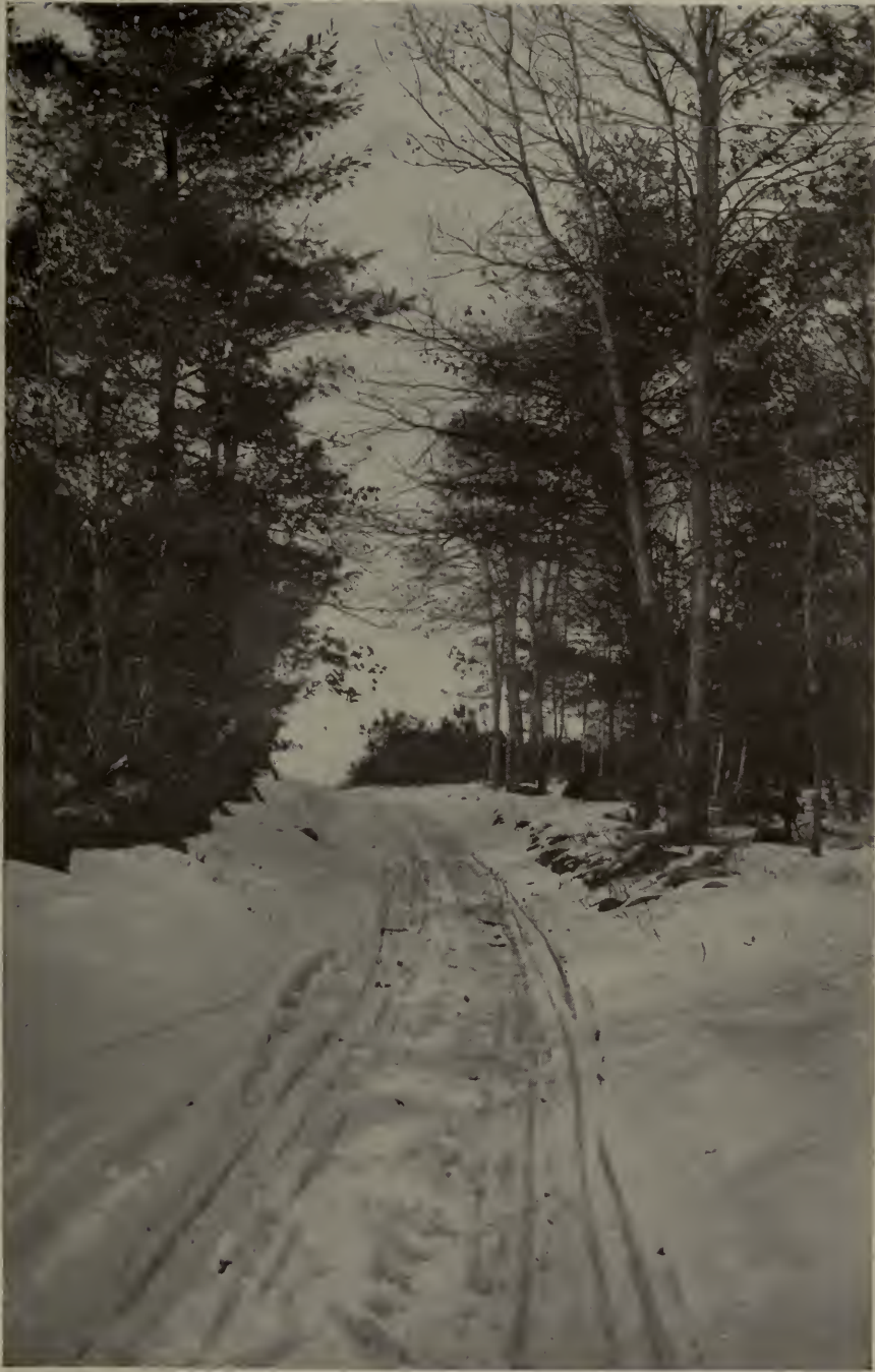
A WINTER SCENE COMBINING DECIDUOUS TREES AND EVERGREENS