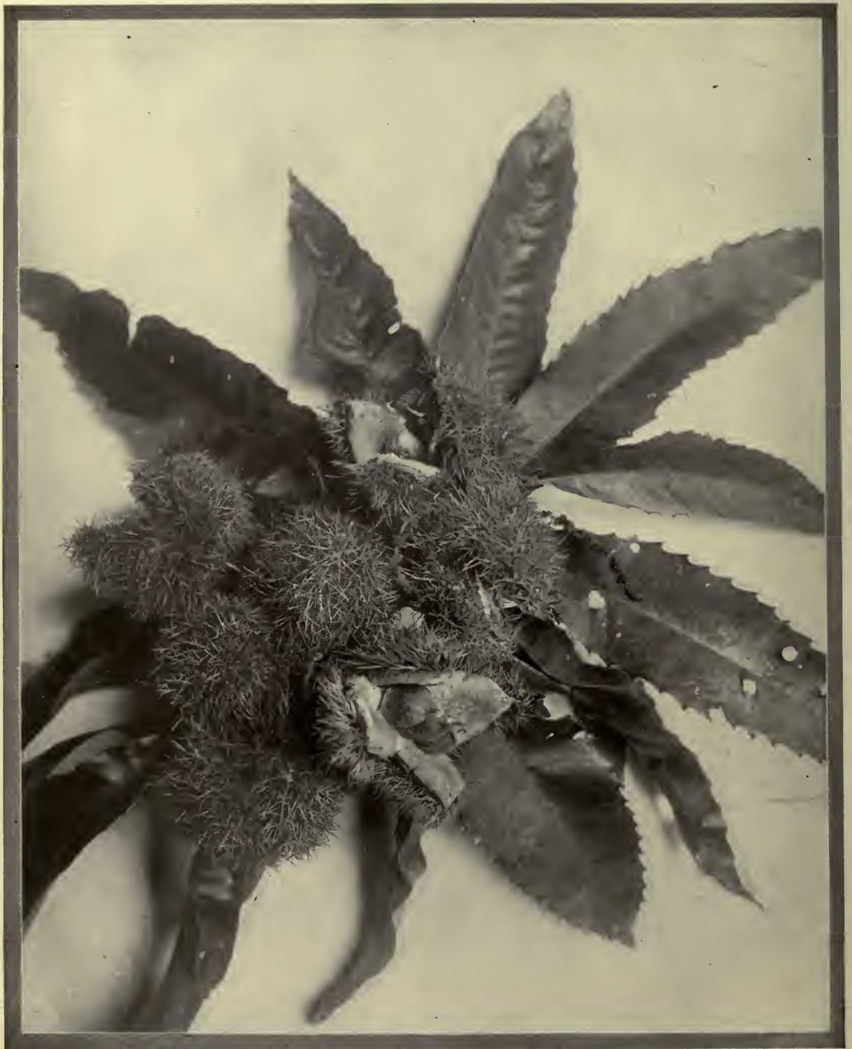
THE OPENING OF THE CHESTNUT BURR