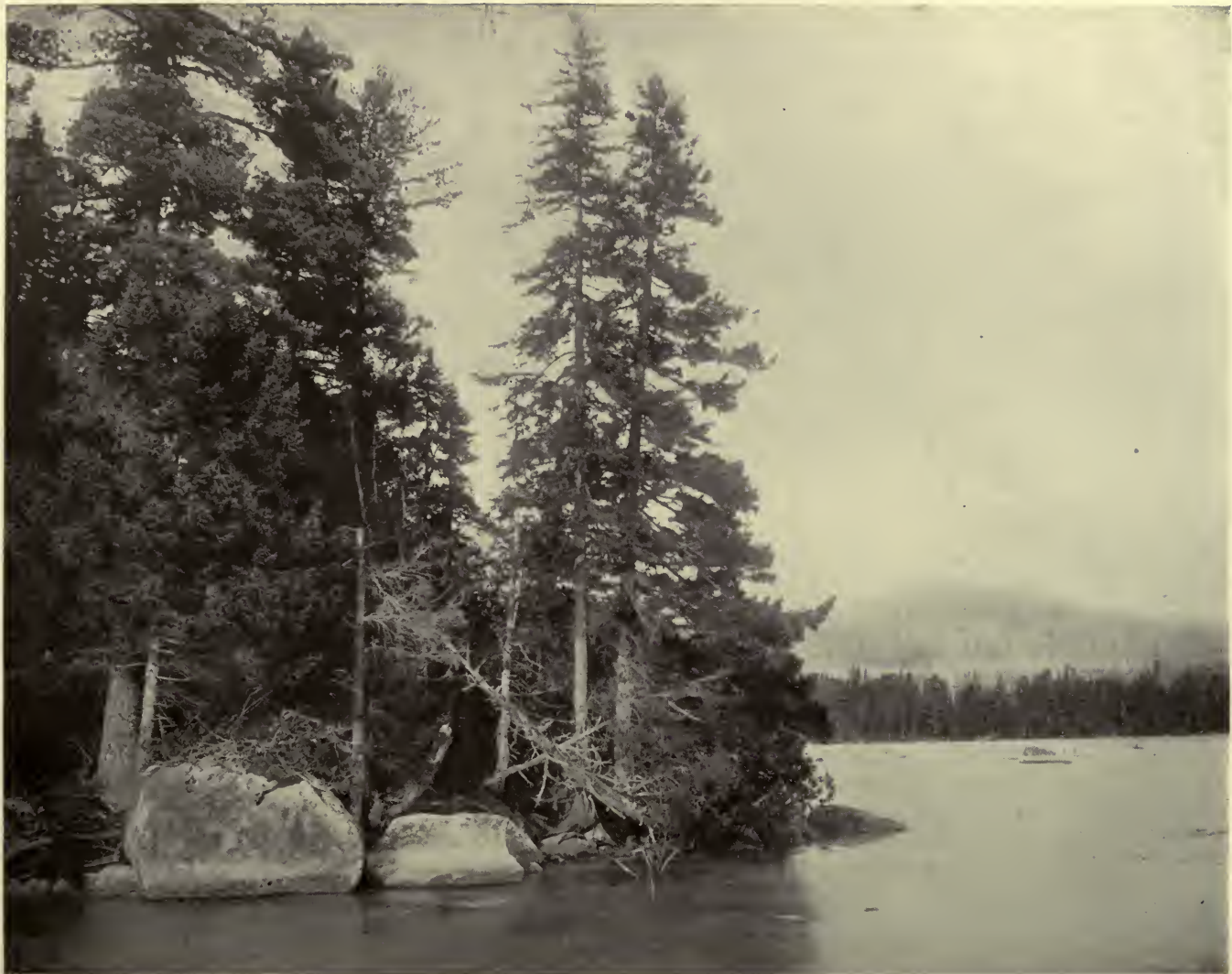
A NORTHERN LANDSCAPE SHOWING THE PICTURESQUE EFFECT OF THE CONIFERS—PINES, SPRUCES AND FIRS