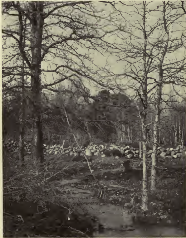
THE INTERMINGLING BRANCHES OF THE SWAMP WHITE-OAK

As I have already said in another book, 1 one of the most interesting ways to know a tree is to be able to recognize it at a distance by its general outline. It is surprising how easy such recognition becomes to one who looks for the distinguishing characters of tree growth. Many trees may be known almost as far as they can be seen, and it is a real pleasure to name them when one goes swiftly by in