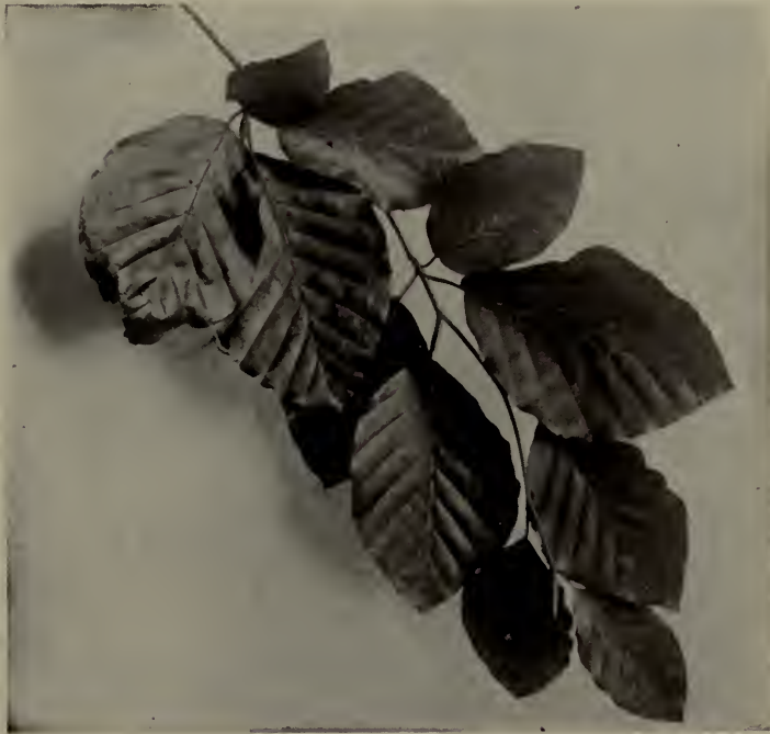
SPRAY OF PURPLE BEECH—A VARIETY OF THE ENGLISH BEECH

The chief beauty of the Silver Bell lies in its pendent blossoms, which seem like snowdrops hung upon the twigs as the leaves unfold. The flowers are followed by the winged fruits, which remain on the tree a long time, nestling among the leaves. As an ornamental shrub for the lawn the Silver Bell has few equals.