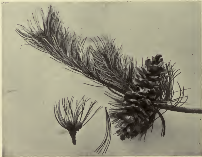
CONES AND LEAVES OF THE SMALL-FLOWERED JAPANESE PINE ( PINUS PARVIFLORA )

Another maple which may have originated in the Orient but has been