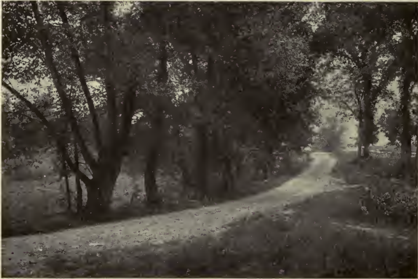
TREES BECOME OF GREATEST INTEREST IN SPRING

Next to the outlines as revealed against the sky the most striking features of the winter trees are found in the bark of the trunks. The mottled blacks and whites of the birches are more familiar to many people through the pictures of the