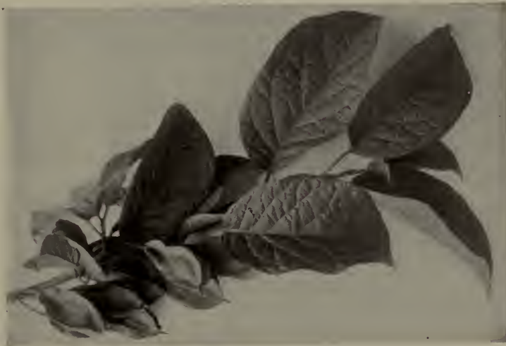
LEAVES AND FRUIT OF THE SILVER BELL

This Empress Tree is one of the very few arborescent forms in the great Figwort Family. In most nursery catalogs and many books it is listed as Paulownia imperialis but the accepted technical name is now P. tomentosa . The tree is closely related to the catalpa and resembles the latter in many ways. The blossoms appear in spring before the leaves, being borne in large panicles, which are very suggestive of those of the catalpas, except for the blue of the corollas. After the blossoms fall the large leaves come out, most of them broadly ovate but some three-lobed. The ovaries develop into good-sized leathery capsules, which hang on in