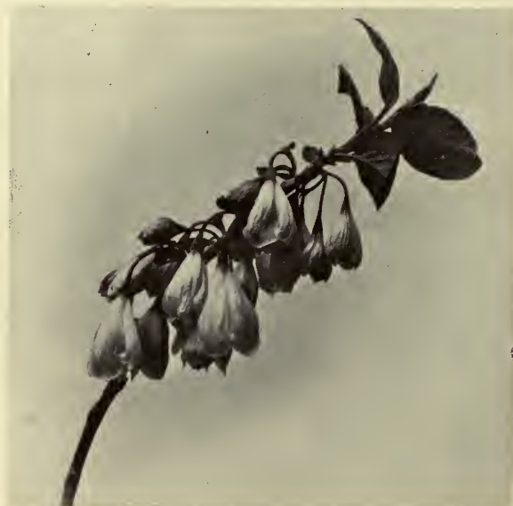
SILVER BELL BLOSSOMS

Among the ornamental conifers an almost bewildering variety of foreign species are offered by the larger nurseries. Firs, spruces, hemlocks, arbor vitæ, cedars, cypresses and pines all have their representatives from the most remote regions of the globe. As we should expect from our experience with other plants some of the most distinctive of these come from Japan. Many people are familiar with pictures of Japanese landscapes to which the pine trees give such picturesque beauty. Some of the most attractive of these pines have been introduced into