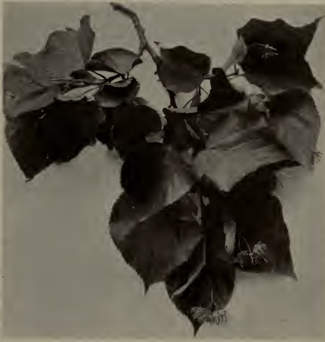
FLOWERING BRANCH OF THE EUROPEAN LINDEN

The Oriental Plane is a more compact tree than its wide-spreading American cousin—our familiar sycamore. The latter soon becomes too large and spreads