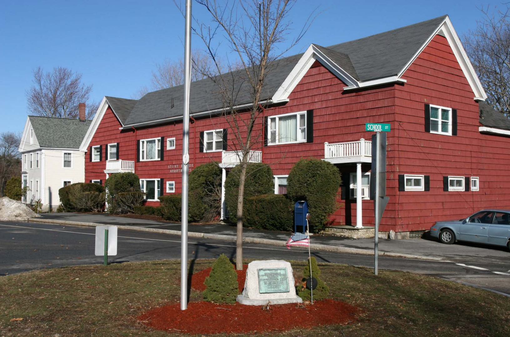
Main And School Streets - Quessy Monument