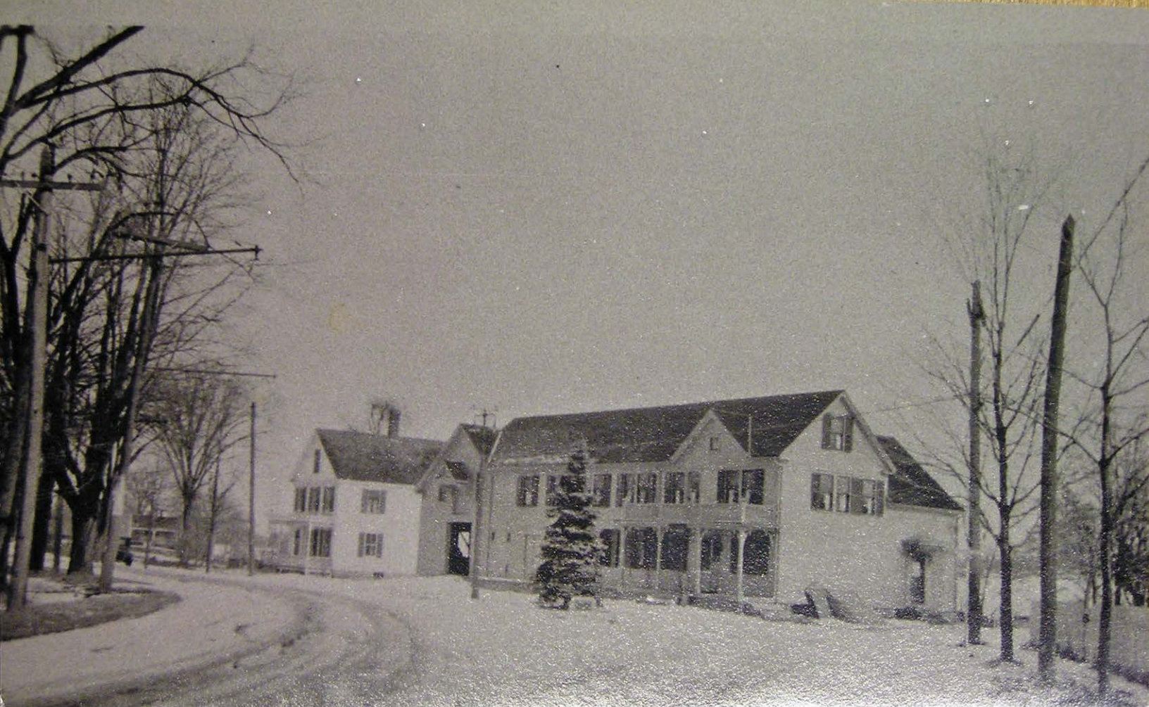
Monument and Spruce tree in place, 1920s