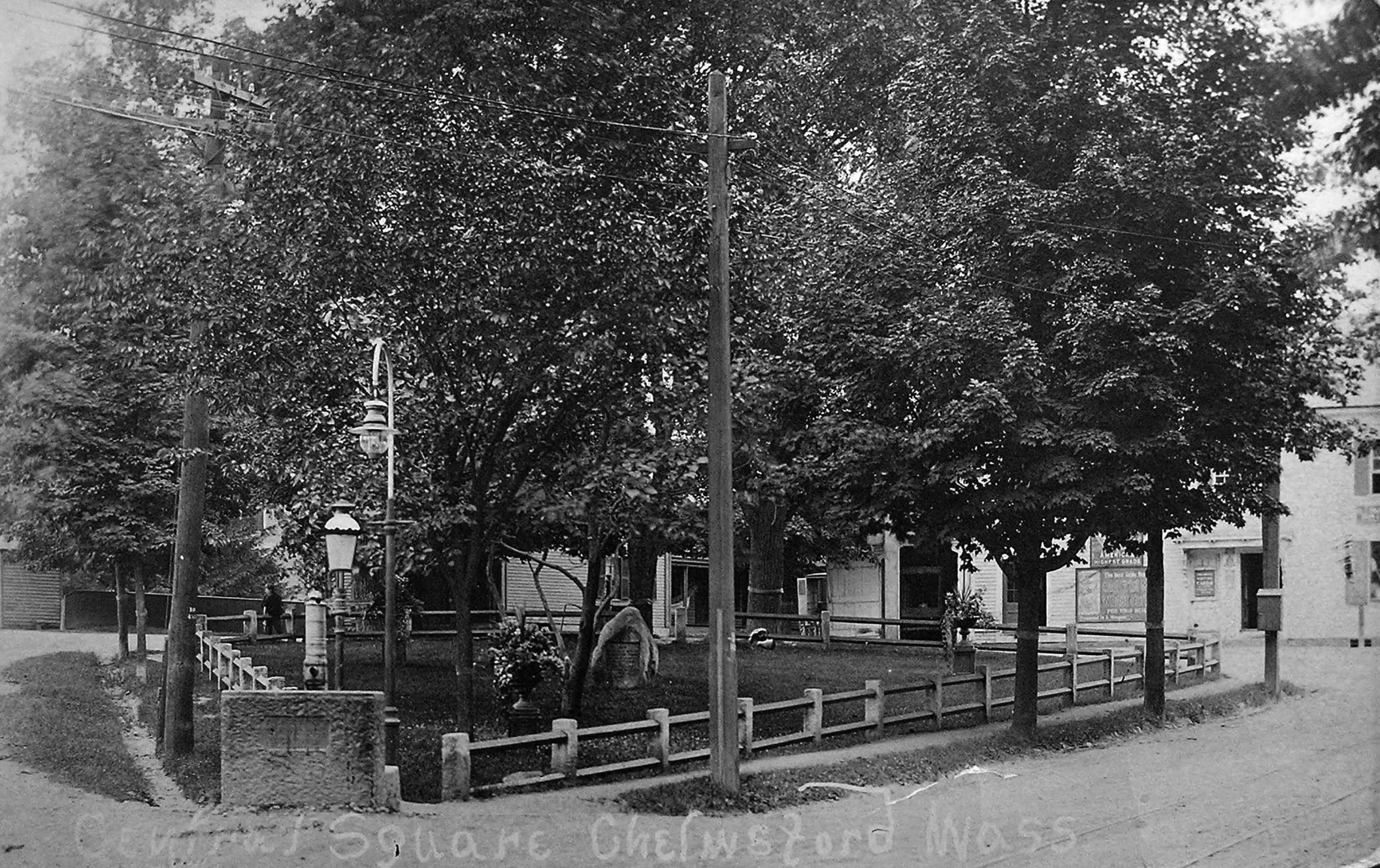
Central Square Chelmsford Mass