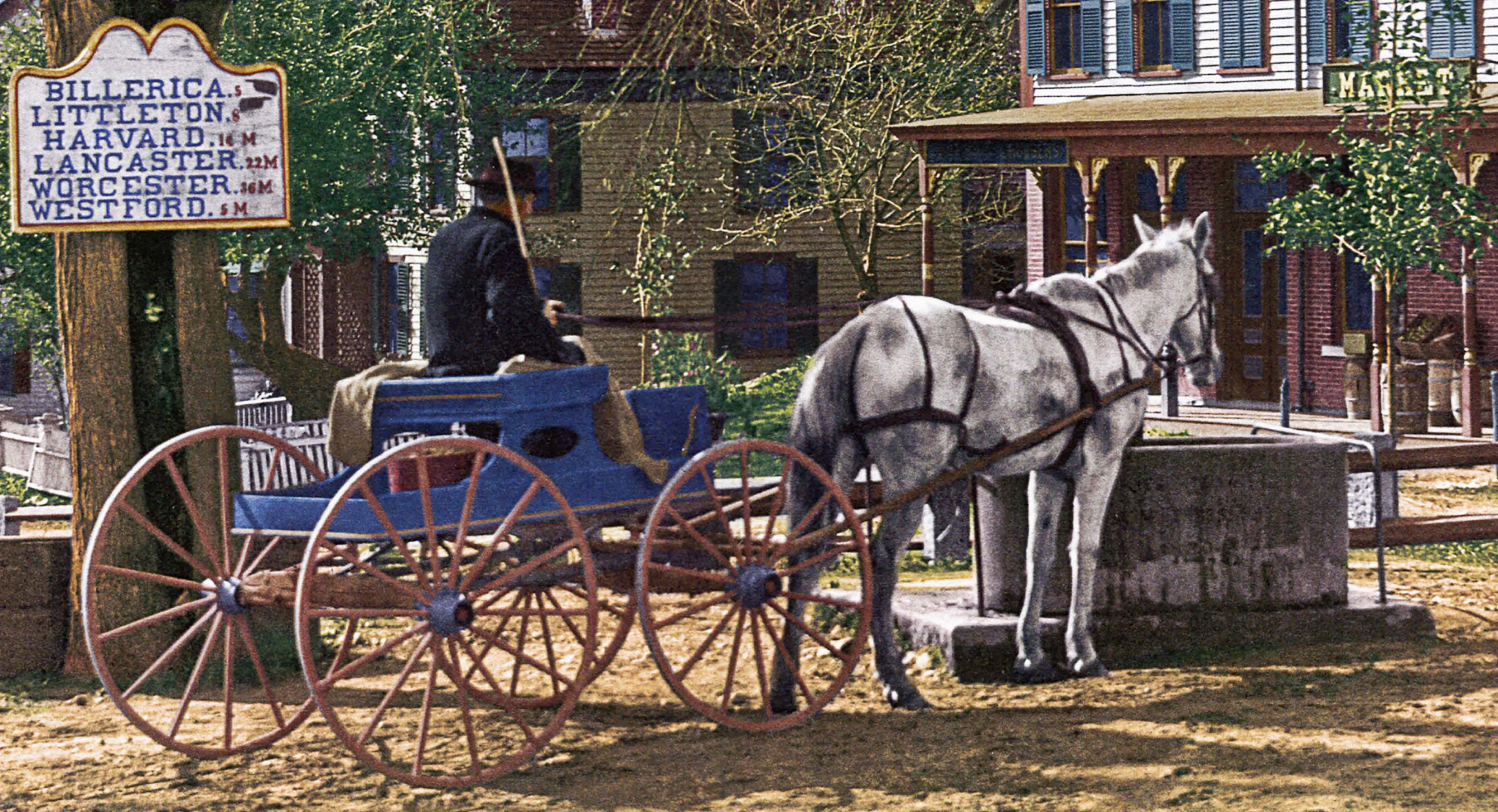
colorizing done for Drum Hill TD Bank