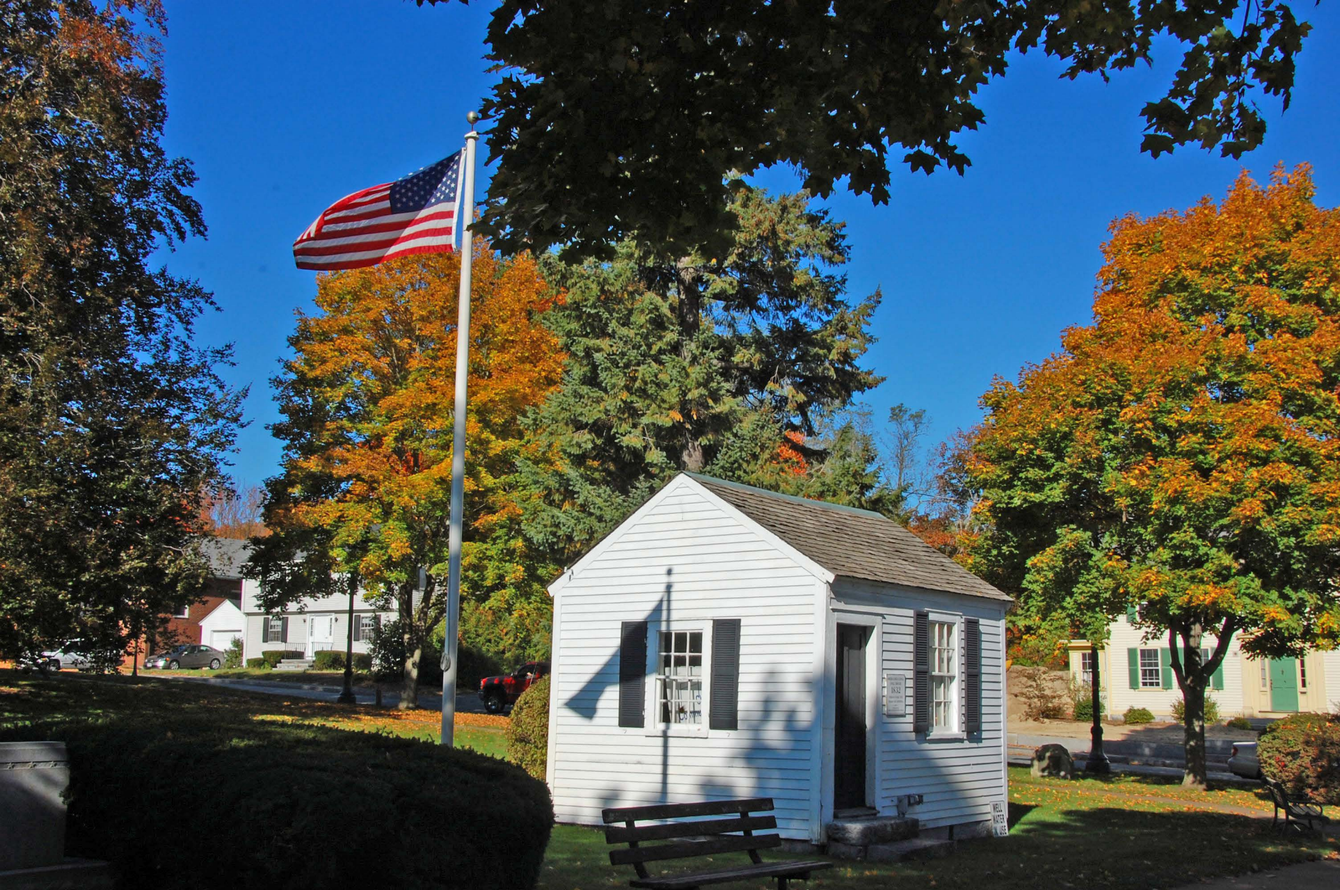
Toll House final location on Chelmsford Common 1977-Present