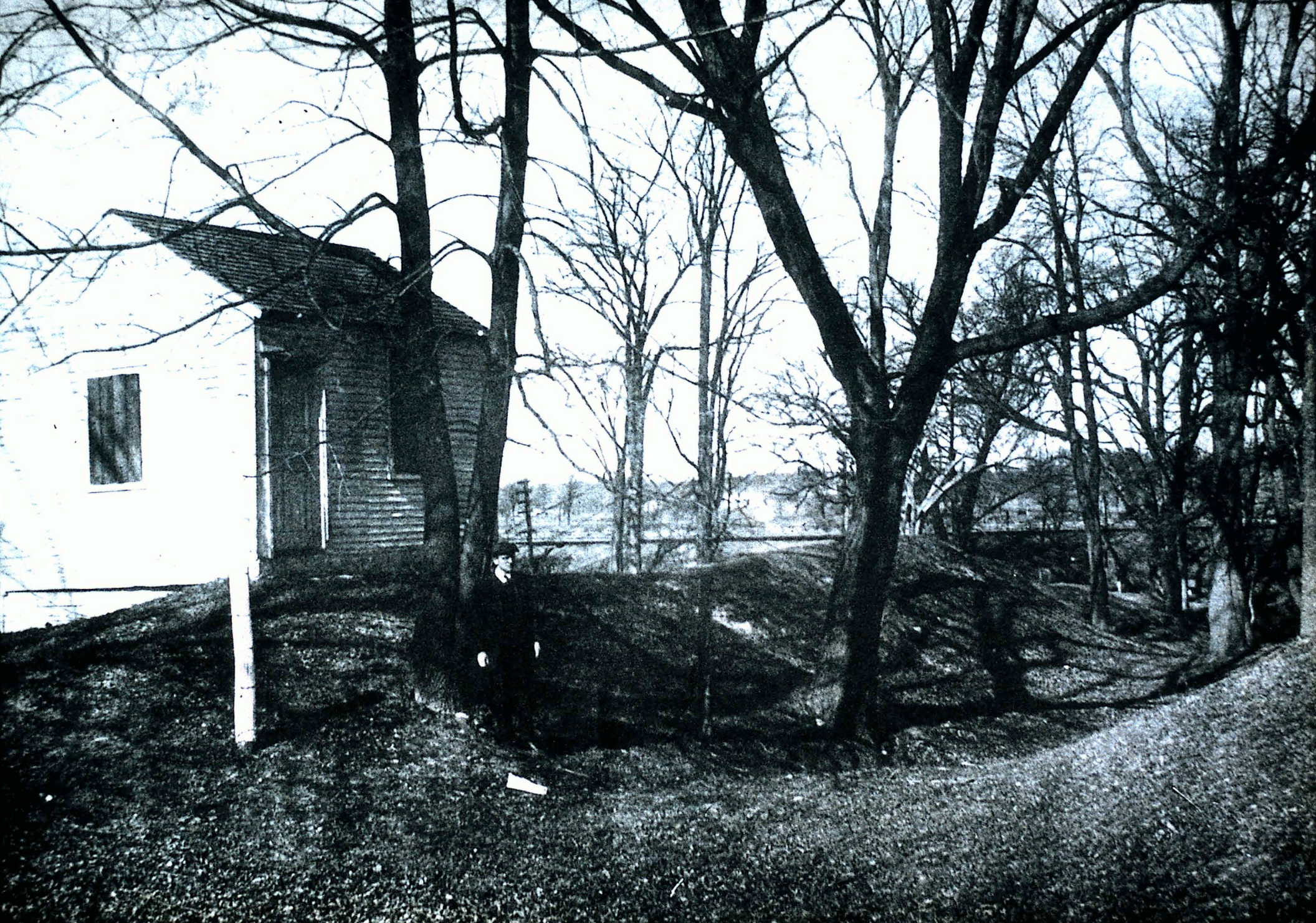
Original location next to Middlesex Canal, 1832-1930s, RR tracks and river beyond