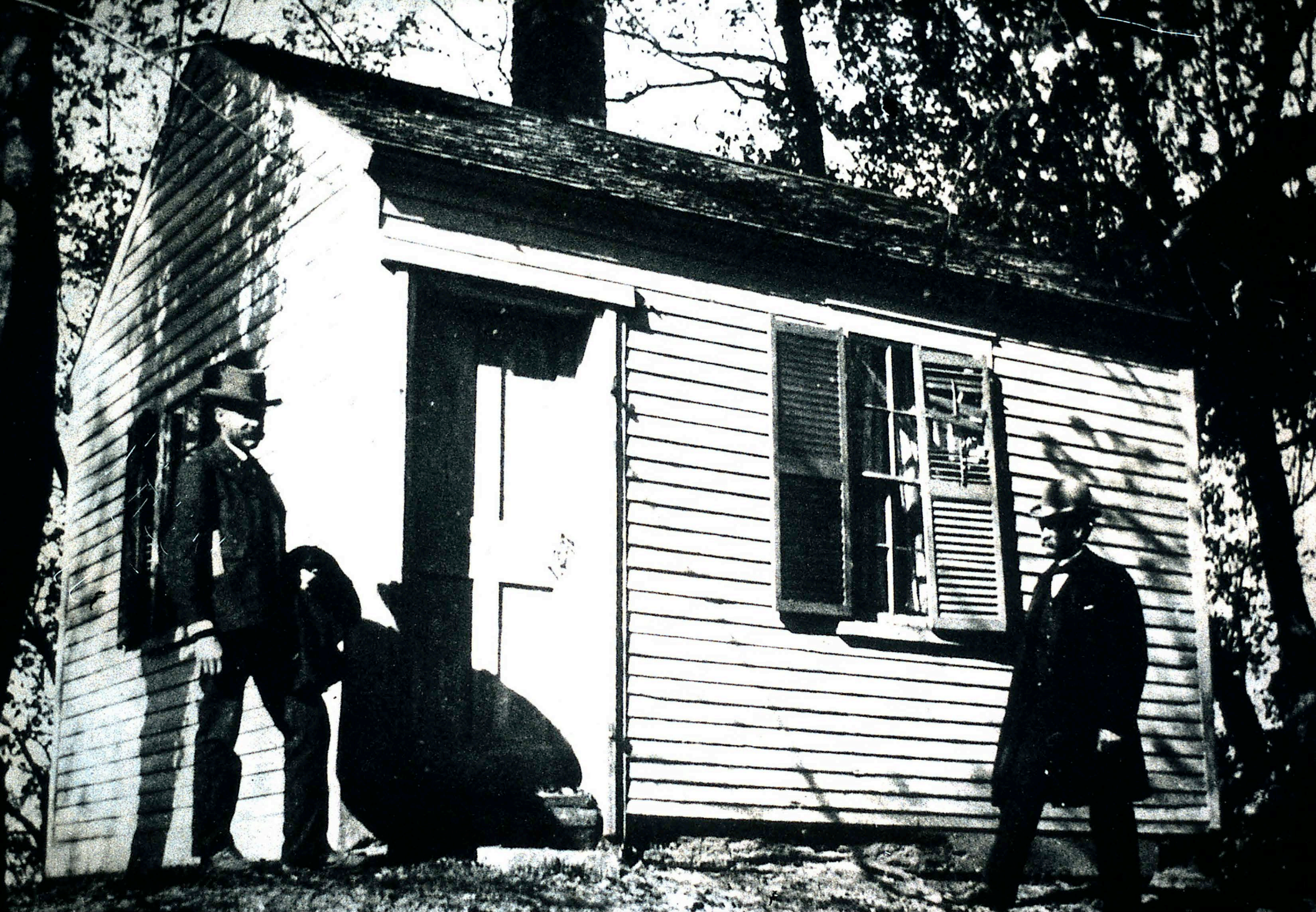
Original location next to Middlesex Canal in Middlesex Village, 1832-1930s