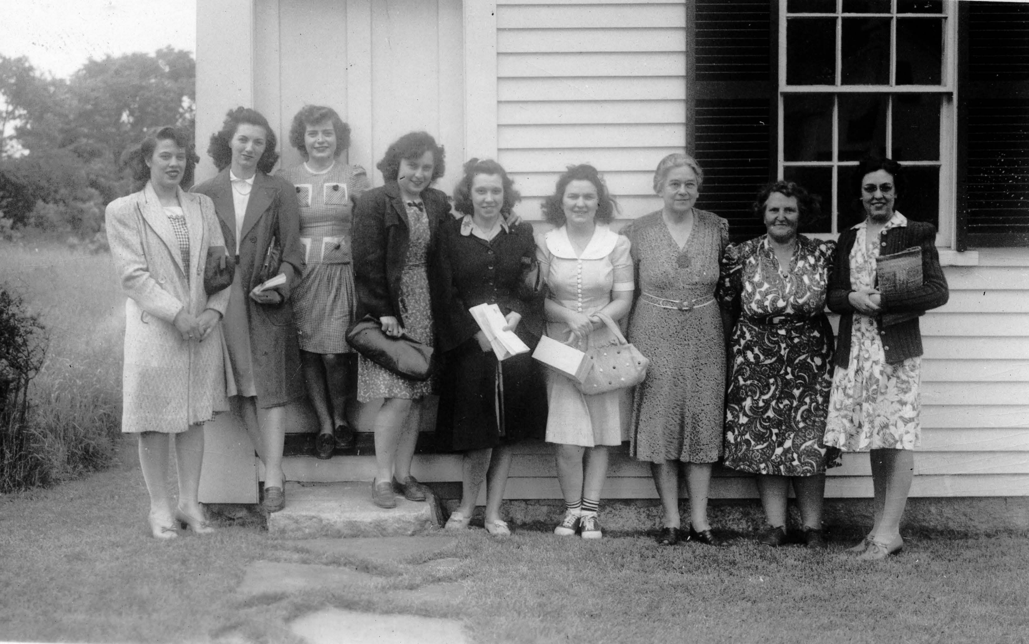
In the care of Proctor Lumber Company in North Chelmsford, 1930s-1955