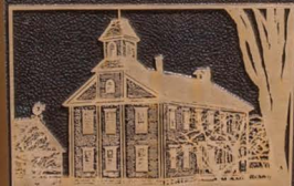
Centre School On this site from 1851-1928