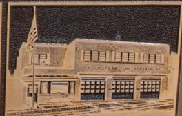
Center Fire Station On this site from 1952-2015