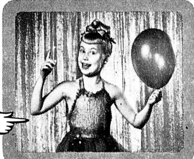
CHILD PERFORMERS. Talented singers, dancers, musicians inspire your own children to learn faster, practice longer, willingly cultivate their own talents.

With TV this magic world is theirs to enjoy every day!