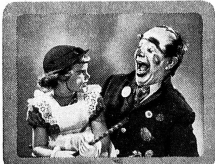
THE WONDERFUL world of make believe—Experts say every child needs it as part of his normal development. And it makes mother's life a lot easier—especially on rainy days.