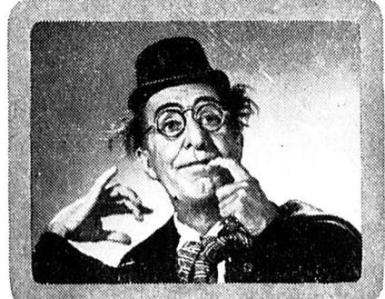
LAUGHTER under your roof—the shared pleasure that binds your family closer. The greatest comedians of the entertainment world are in your living room every night on TV.