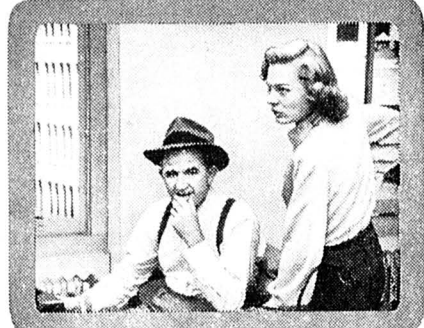
DRAMA for young and old—The brightest stars of the theatre now perform to millions—bring the great plays of all time to audiences who never before could see them.